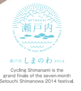
瀬戸内しまのわ 2014 Cycling Shimanami is the grand finale of the seven-month Setouchi Shimanamiwa 2014 festival.